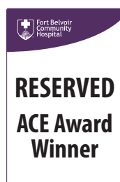
Preferred Parking Space (1 year)