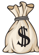
$500 Cash Award