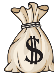
$1,000 Cash Award